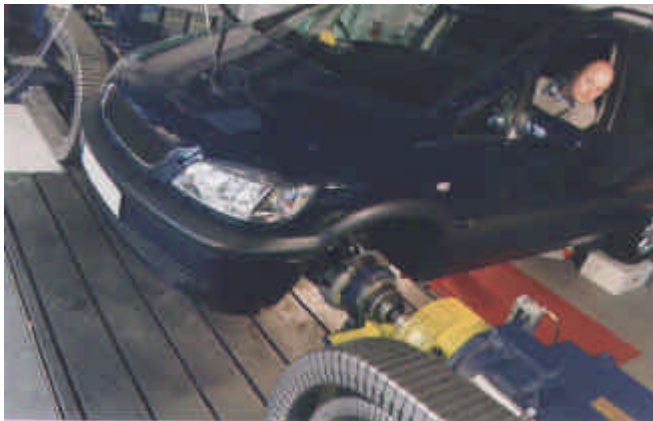
Fig. 3 Multiconfiguration Test Bed for Fuel Cell Drives – Complete Vehicle Setup