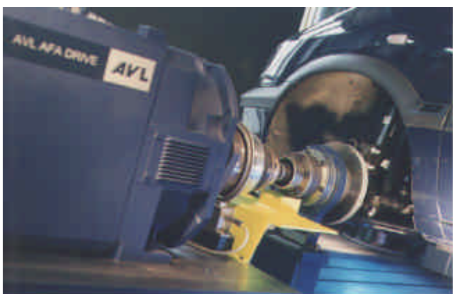
Fig. 4 Multiconfiguration Test Bed for Fuel Cell Drives – Complete Vehicle Setup