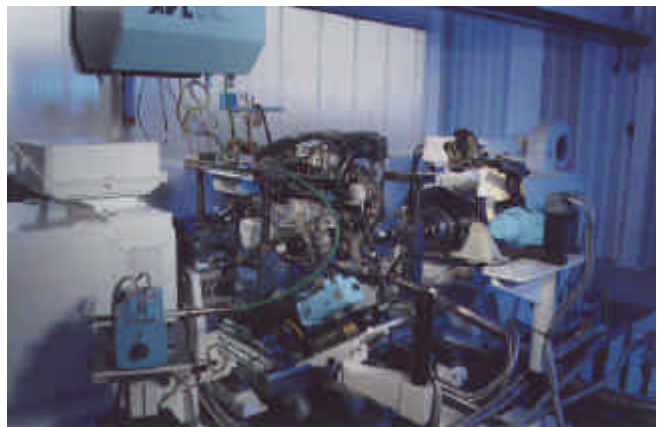
Fig. 2 AVL powertrain test bed with combustion engine and manual gearbox in Front-Wheel-Drive configuration