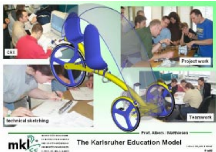
Fig. 2: The Karlsruhe Education Model

The exercise deepens the theoretical knowledge and shows how to use it in practice. Special elements of the exercise have to be processed within the framework of the third module of this teaching model: the workshop. In the workshop student teams work on concrete practical tasks. At the beginning of this event, the emphasis is the practical understanding of machine-elements by the students. The workshop shows special construction-elements and -systems which guide through the whole event and which are already completely known in function and design by the students.