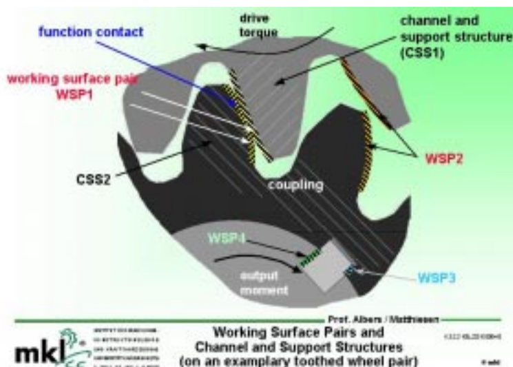
Fig.3: Working Surface Pairs and Channel and Support Structures

The lecture is done completely with the support of digital techniques of presentation. Therefore it is possible to include digital video sequences into the lecture and to impart knowledge whilst saving a lot of time.