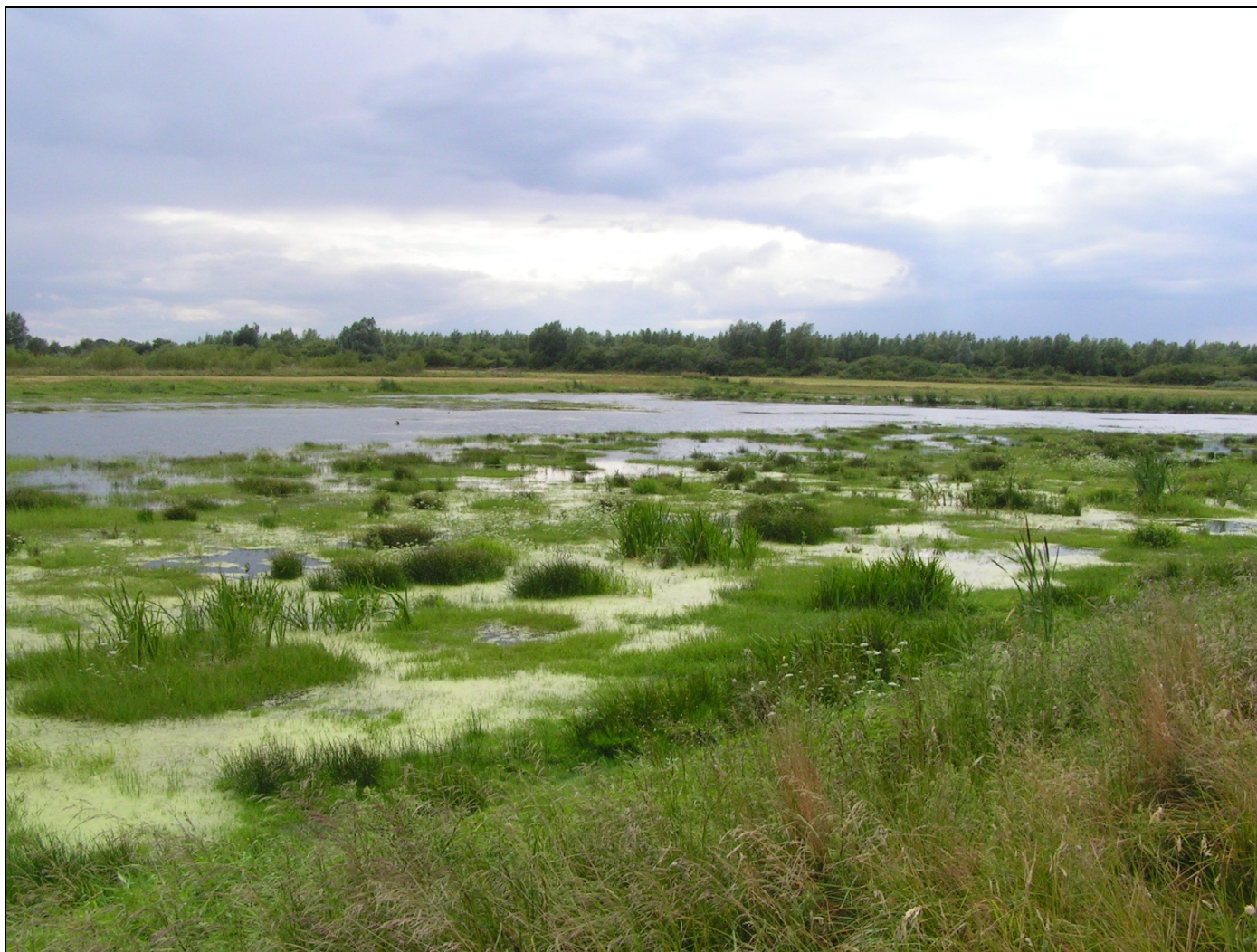
Fig. 4. Natural succession on former pasture land creates a diversity of habitats on an excavated flood channel