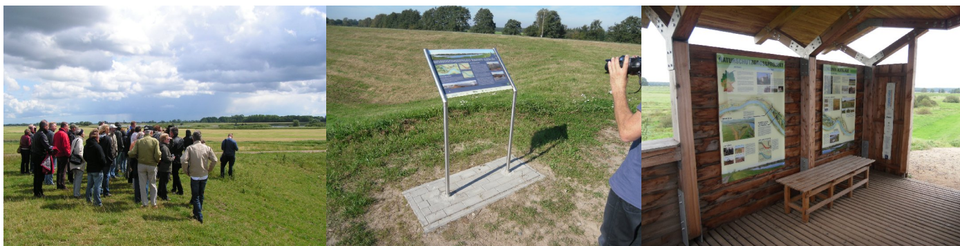
Fig. 3. Excursions and information displays and a viewpoint shelter play an important role to convey the message of the project.