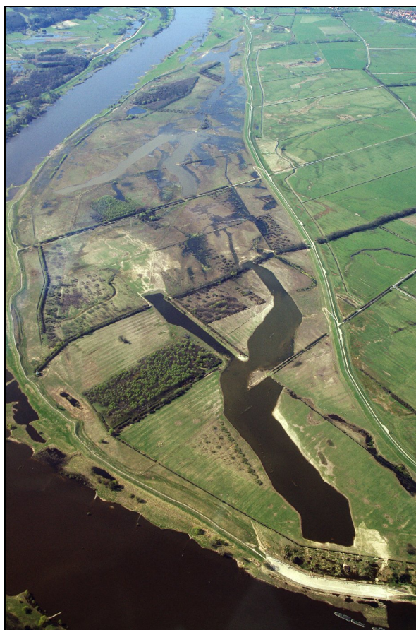
Fig. 2. 420 hectares of rich-structured floodplain habitat developing on former pasture land.