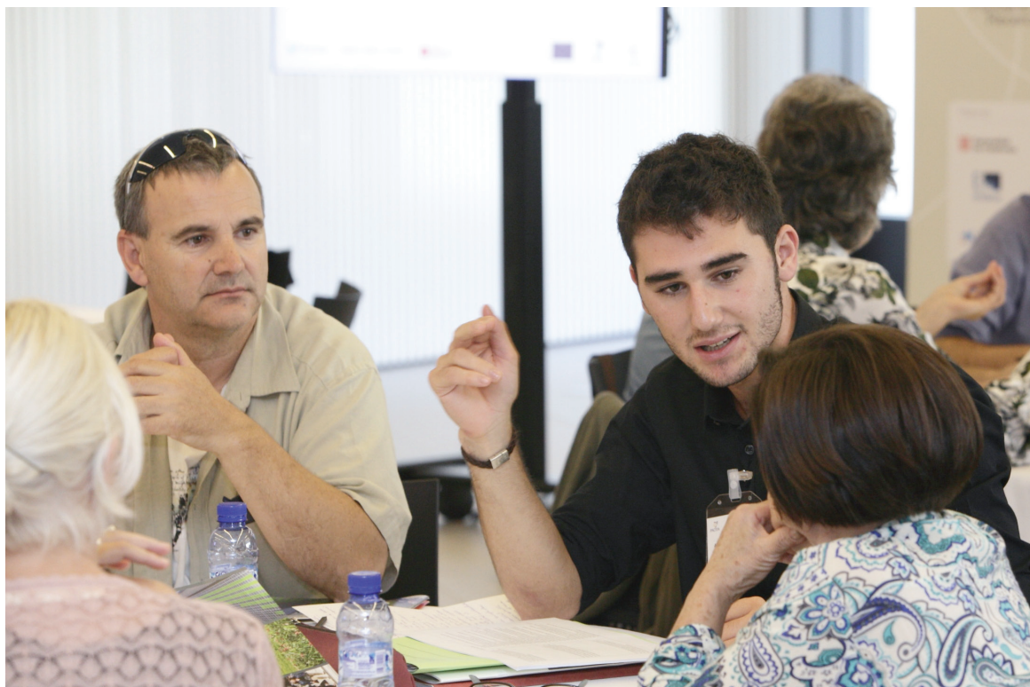
Catalan citizens in consultation

The only options currently available for citizens to get involved in European policy-making are the EU Commission's Citizens' Initiative and via projects in research programmes. Many knowledge institutes are experimenting with citizen participation in science, research and innovation. But for many partners, this kind of engagement is quite new. This was another goal of the PACITA project: it aimed to expand citizen participation processes to countries with little or no experience of citizen participation as a policy consultation practice with opportunities to learn from the more experienced ones.