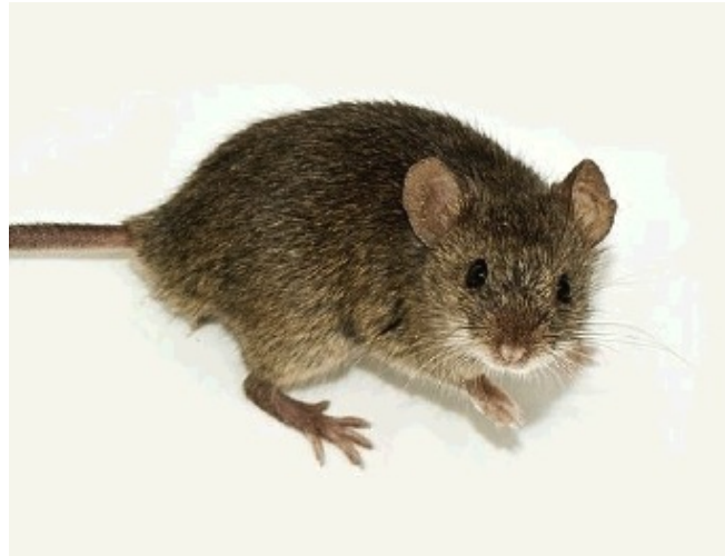
Fig. S1. Picture of a mouse as presented in the instructions of the experiment 3

Video: In the instructions subjects were informed about the process how mice are killed: “The mouse is gassed. The gas flows slowly into the hermetically sealed cage. The gas leads to breathing arrest. At the point at which the mouse is not visibly breathing anymore, it remains in the cage for another 10 minutes. It will then be removed.” They were also shown a short video: The mice first move vividly in the cage, then they successively slow down. Eventually they die, with their hearts beating visibly heavy and slow. Comparable demonstration videos are publicly available at laboratories conducting animal experiments.