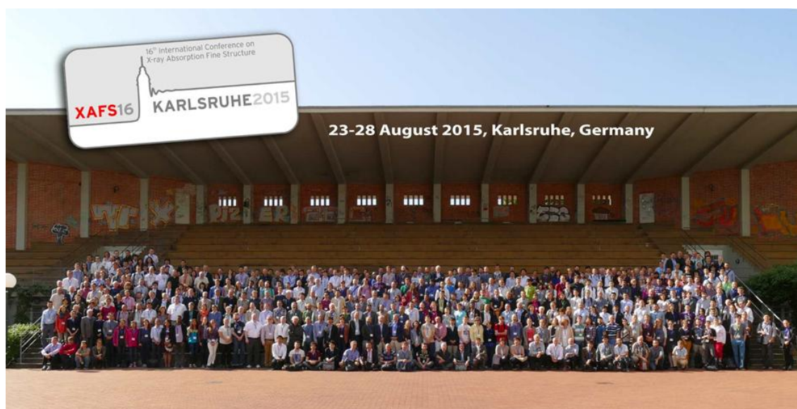
Figure 2. The official conference photo taken at the site of the old stadium, KIT Campus South. The inset shows the conference logo designed by Wilfrid Schroeder, KIT († 2015).

There was a substantial number of materials science studies submitted to XAFS16, which were split into the separate fields related to the ‘ Science of materials ’ (VI) and ‘ Energy-related materials ’ (VII). In this context, not only studies highlighting structure-property relationships were presented, but also exciting operando studies on batteries and energy storage materials. The broadness of the XAFS application field was further demonstrated with plenary lectures, keynote and contributed talks in the field of ‘ Biology and soft matter ’ (VIII). Last but not least, a special session on spatially resolved XAS and X-ray microscopy (field IX: ‘ Microscopy, beamlines, applications, cultural heritage ’) gave an excellent overview of the dynamic developments in this area. Microscopy is now conducted on all length scales from the \mu\text{m} (or even mm/cm) to the 50 nanometer range. Although ptychography offers new opportunities, achieving X-ray absorption spectroscopy contrast at the ultimate 5 nm scale remains a wish not yet fulfilled. Finally, the important role that X-ray absorption spectroscopy has traditionally played in the commercial use of synchrotrons and for industrial research was reflected in a special symposium dedicated to current and potential applications in industrial XAFS research.