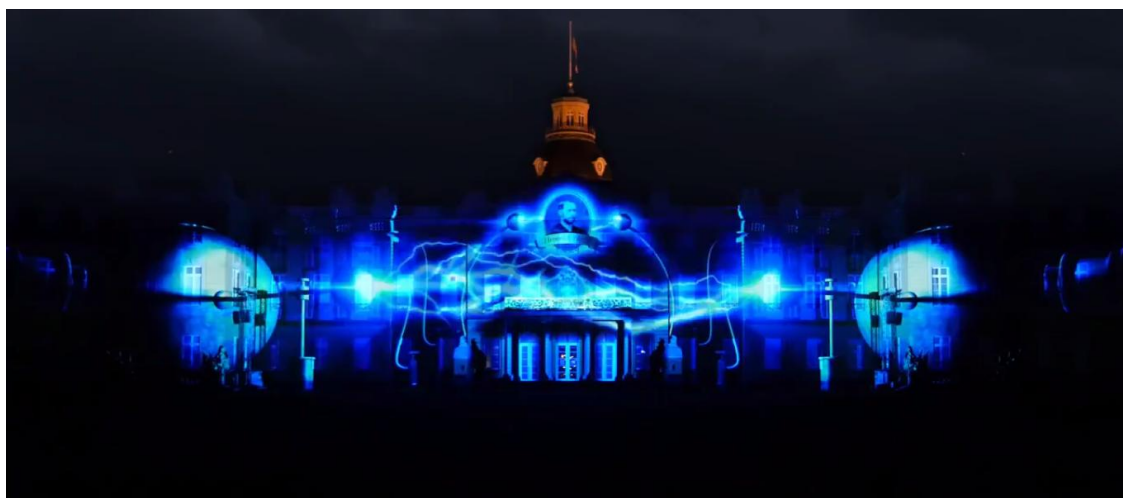
Figure 1. Illumination of the façade of Karlsruhe’s palace at the heart of the town center during the “Schlosslichtspiele” in summer 2015. The installation symbolizes the discovery of electromagnetic waves (1886) by Heinrich Hertz in Karlsruhe at the Technische Hochschule, a predecessor of today’s KIT.