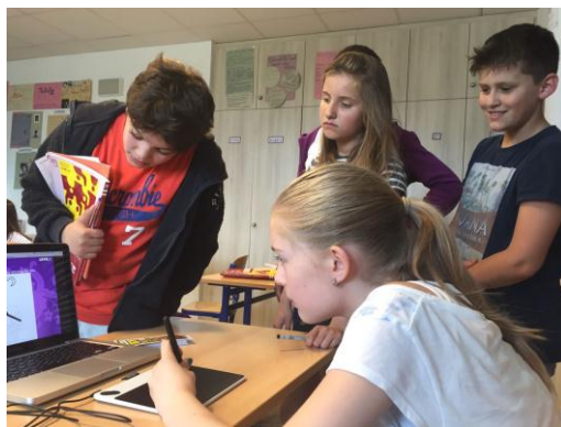
Fig.1. A child using the graphic and pen tablet.

BatiKids has four main learning objectives: i) to motivate children to learn the real process of making batik; ii) to understand the philosophy of the batik patterns; iii) to teach how to mix colors, and iv) to teach hand movements in relation to the use of canting in the real process. Due to the limited time, it was not possible to talk deeper to find out more about the children. If more time were available, the authors would have tried to engage children in evoking joyful memories in order to make them feel more comfortable [23].