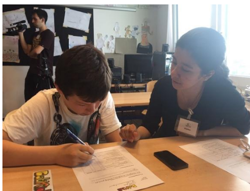
Fig. 2. An interview with a child after the workshop.

The issues, indeed, arose mainly came from the application BatiKids itself. Some instructions were unclear for children. Therefore, during the workshop, it is necessary that an author sat next to the children and assisted them when they encountered any issues.