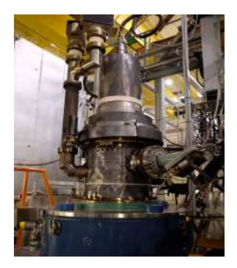
Fig. 3: The coaxial-cavity long-pulse gyrotron in the Oxford Instruments superconducting magnet with the calorimeter for the RF power measurement.

The misalignment, mentioned above, of the insert is negligible and therefore a stable gyrotron operation can be expected.