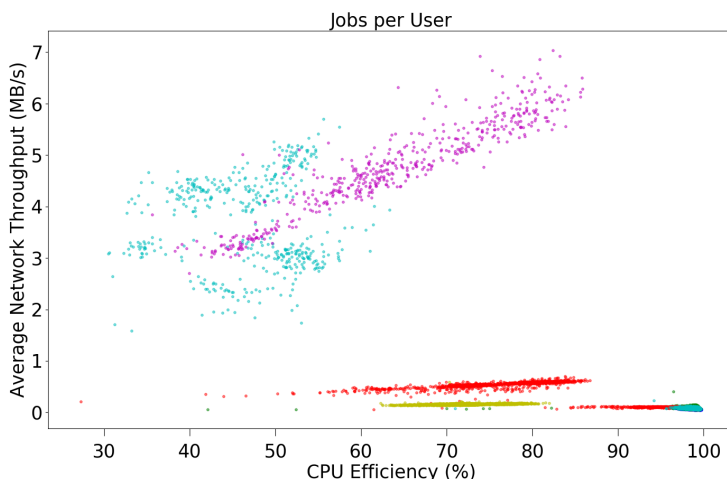
Figure 3. Monitoring data of finished jobs in our OBS which shows the CPU efficiency and the average incoming network throughput per job. Each color represents another user, which typically has one or two workflows. The distribution of the jobs is corresponding to their workflows.

Furthermore, we faced the challenge to manage a heterogeneous set of resource providers and resources in a dynamic way. We described our new approach via a feedback loop which should better react to the current demand and resource situations. This results in more efficient usage of the integrated resources. For this approach, we are currently developing the corresponding software. Furthermore, we are studying the correlation between CPU efficiency and network throughput per job to detect network limitations to further improve resource scheduling.