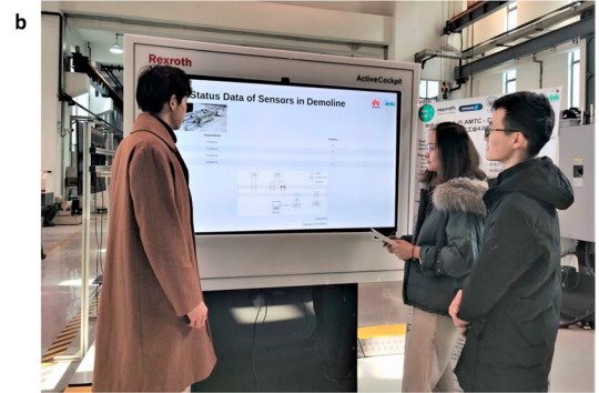
Fig. 3. (a) Phases of the 5G and AI training [18, 19]; (b) Actual 5G and AI application scene