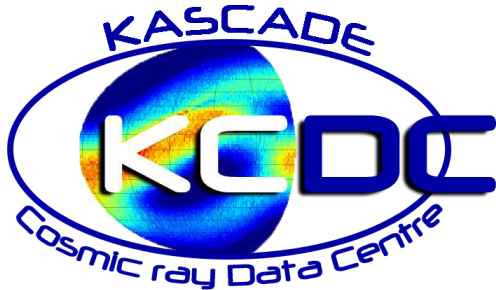
Figure 1: Logo of KCDC. The link to KCDC is: https://kcdc.iap.kit.edu .

Campus North, Karlsruhe, Germany (formerly Forschungszentrum Karlsruhe) at 49.1°N, 8.4°E, and 110 m a.s.l.