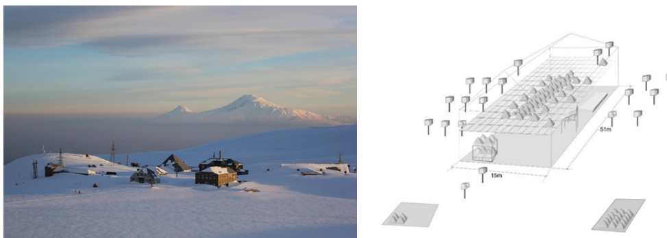
Figure 3: Left: View of the Maket-Ani location at Mount Aragats. Right: Maket-Ani detector setup.

Two peripheral points at a distance of 95 m and 65 m from the centre of the installation consist of 15 and 4 scintillators, respectively.