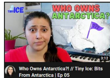
Figure 3: Thumbnail for episode 5 of “Tiny Ice” produced by Jocelyn Argueta.

The videos are aligned to Next Generation Science Standards and Polar Literacy Principles. They are intended for use in after-school, formal, and informal learning environments, while also available to the general public. A basic assessment was created to accompany each video in the series.