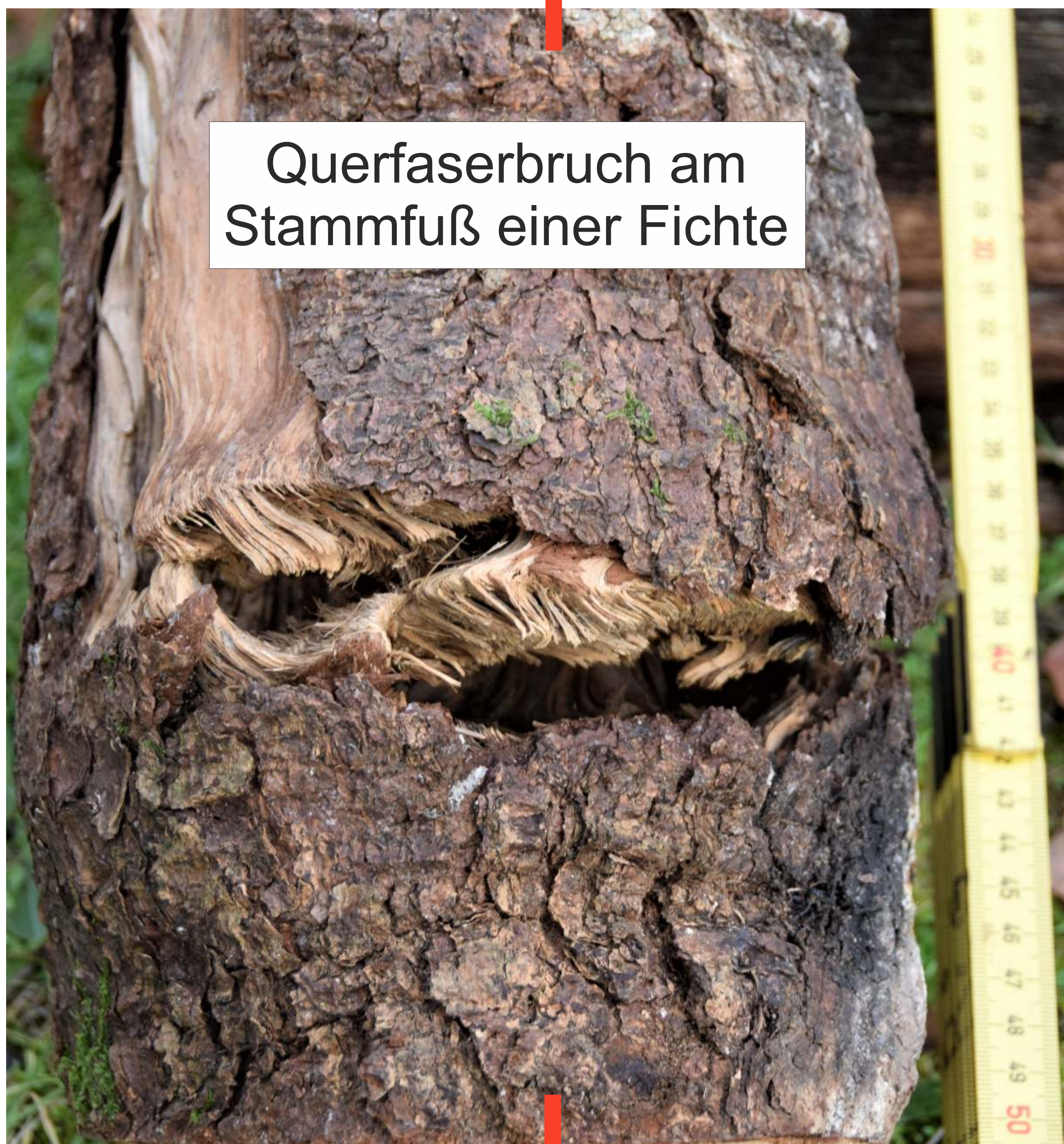
Querfaserbruch am Stammfuß einer Fichte