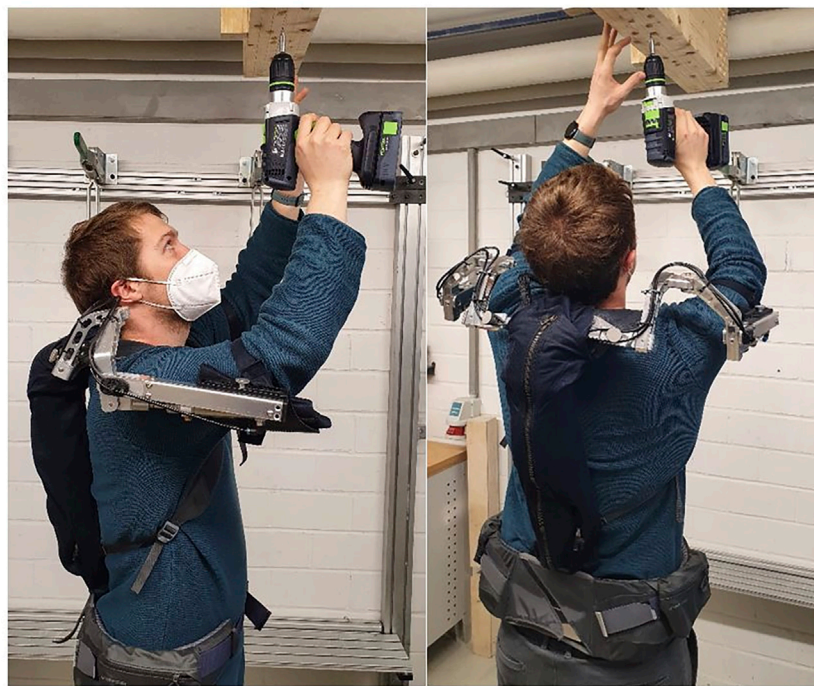
FIGURE 1 | “Lucy” exoskeleton for over head work (e.g., Yao et al., 2021).

There is a wide variety of upper-limb exoskeletons with regard to construction forms and types of support. To date, the most common commercially available exoskeletons are shoulder-supporting exoskeletons that usually have a rigid structure on the back and arm cuffs, which are coupled (Exoskeleton Report,