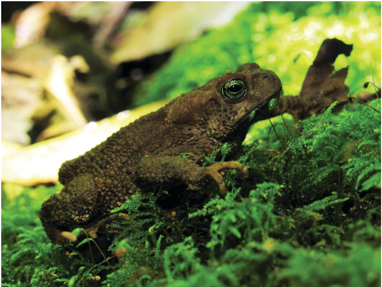
Figure 1. Rhinella rumbolli juvenile, MHNC-A 2771/PMM-100, collected at San Lorencito, Méndez province, Tarija Department, Bolivia, in the Boliviano Tucumano ecoregion.

Identification. Based on the description by Carrizo (1992), the two individuals were identified as R. rumbolli by the presence of a well-developed supraorbital crest and supratympanic crest, a sharp preorbital crest, a very prominent, ovoid paratoid gland, a small tympanum, medium-length fingers and toes with the first finger slightly shorter than the second, a more conspicuous dorsolateral chain from paratoid to groin, glands on the