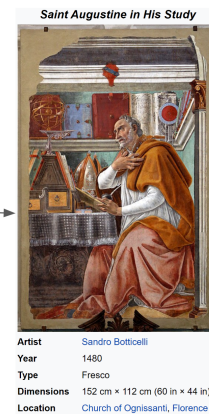
Figure 2: Example of recognition and linking of artworks' references: the second sentence (from the top) shows a long description linked to a specific painting.

Sequences of words referring to artworks are often triggered by verb phrases which are referred to the activity of an artist ( painting ). Moreover, for artwork resolution, the previously described steps of ER and EL, coreference resolution, time extraction and motif extraction should come into play. The second example (from the top) in Figure 2 shows how to correctly interpret the creator of a work a personal pronoun has to be resolved. Finally, artwork descriptions allow us to extract further contextual information related to an artifact, such as its location and commissioner, or information related to its depicted motifs, which might complement the already existing knowledge about an artwork.