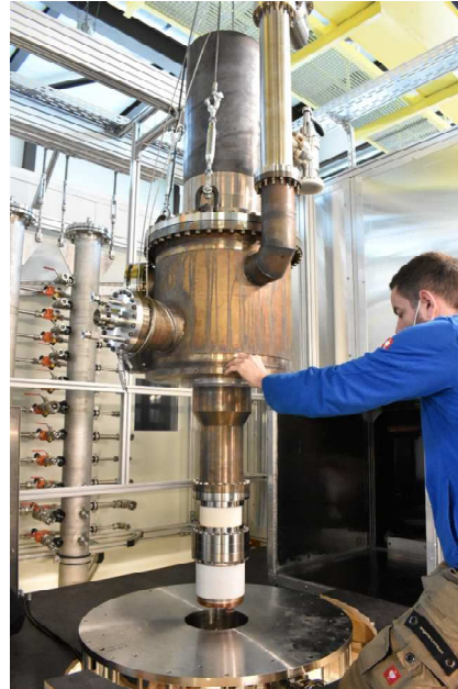
Fig. 3. Installation of a short pulse 1.5 MW 140 GHz gyrotron.