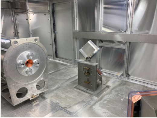
Fig. 2. View of RF transmission system and absorber load

temperature sensors and flow meters are installed in the primary cooling circuits which directly cool gyrotron subcomponents to offer exact measurement of the power loading of the different cooling channels in the gyrotron. Online values of temperature, flow rate, pressure and conductivity of the water are visible to the operator and operation is electrically interlocked by threshold values.