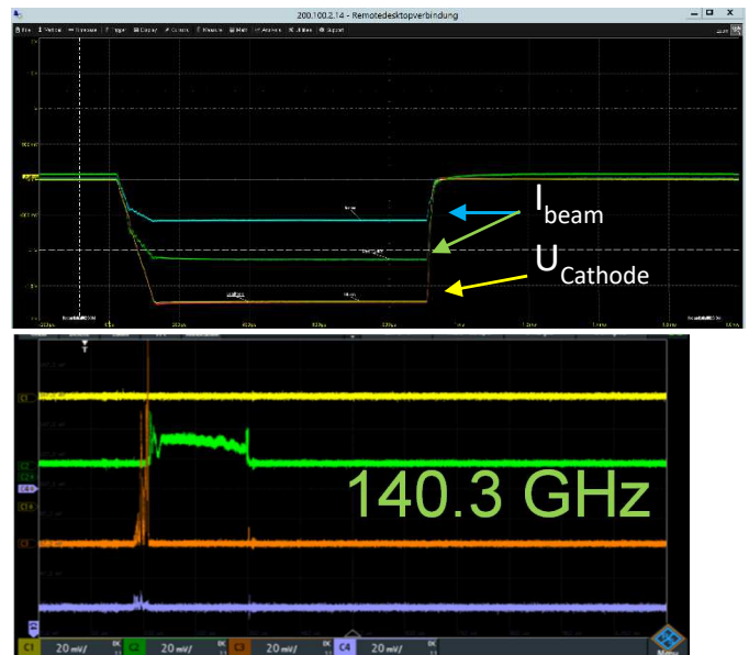
Fig.4: Measurement of beam current and cathode voltage for \sim 1 ms pulse (top), first RF detection (filterbank signal) on FULGOR teststand (bottom).