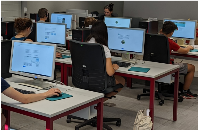
Figure 1: Students working on online courses of the Save the Bees Expeditions by RockStartIT in a computer lab at the KIT

CSEd in secondary school might be an important set screw. In the study area, CS is a mandatory subject in grade 7 (ages 12-13) of secondary school (the gymnasium ), but only in that grade and only since 2016. For grades 8, 9, and 10 there is no dedicated subject for CS. CS is then only selectable in a trade-off with a second foreign language as part of the subject IMP, a combination of informatics (the more common term for CS in Germany), maths, and physics. This drives CS in a challenging situation. CS in this educational level has big pressure to glance at a high stage to attract as many students as possible in order that they are not lost here. This highlights the need for innovative CSEd approaches.