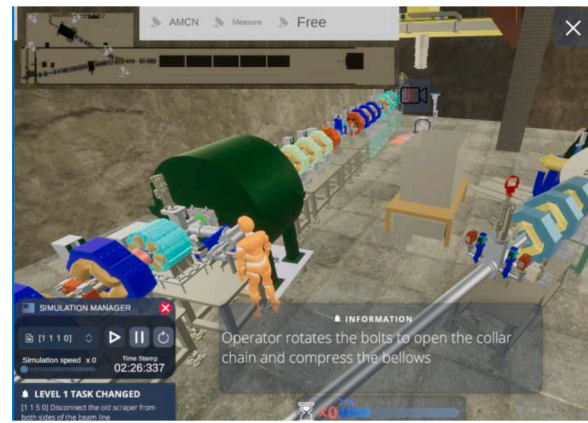
Fig. 4. Screenshot of the HEBT scraper simulation. Manikin simulating worker performing a manual operation.

The iterative process involving: Simulation team, RH equipment designers and plant equipment designers, will prevent inconsistent design of equipment and planning of processes. Nevertheless, the current simulations must be updated when more details of equipment and services are available (cable trays, cooling piping, gas supply and other services)