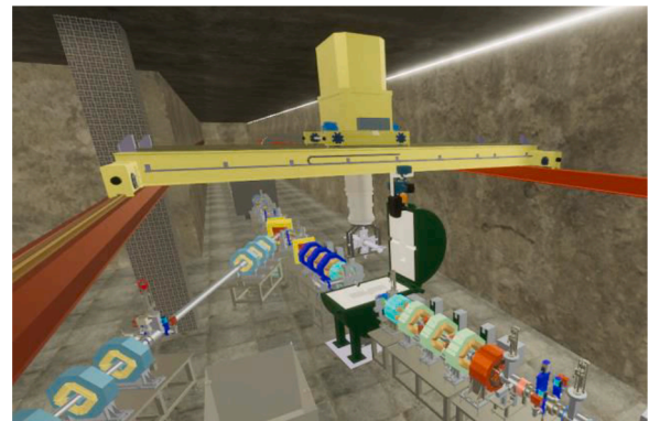
Fig. 3. Removal of HEBT scraper with remote handling bridge crane. Simulation used for FMEA analysis.