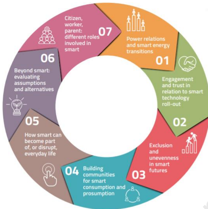
Figure 2. The seven Themes of the Energy-SHIFTS Smart Consumption research agenda.

To emphasise the need to better integrate SSH concepts in interdisciplinary discussions about smart energy futures, we have indicated several key SSH concepts in italics alongside brief definitions and example references 6 . All questions were concerned with low-carbon transitions of the socio-technical systems around energy. Inspired by Rotmans et al (2001), the WG defined transitions as transformation processes in which society changes in a fundamental way over a generation. The WG was committed to the view of innovation and transformation of energy systems as concerning socio-technical systems , in which social and technical elements are interrelated and cannot be understood as separate entities (Köhler et al., 2019; Geels, 2018).