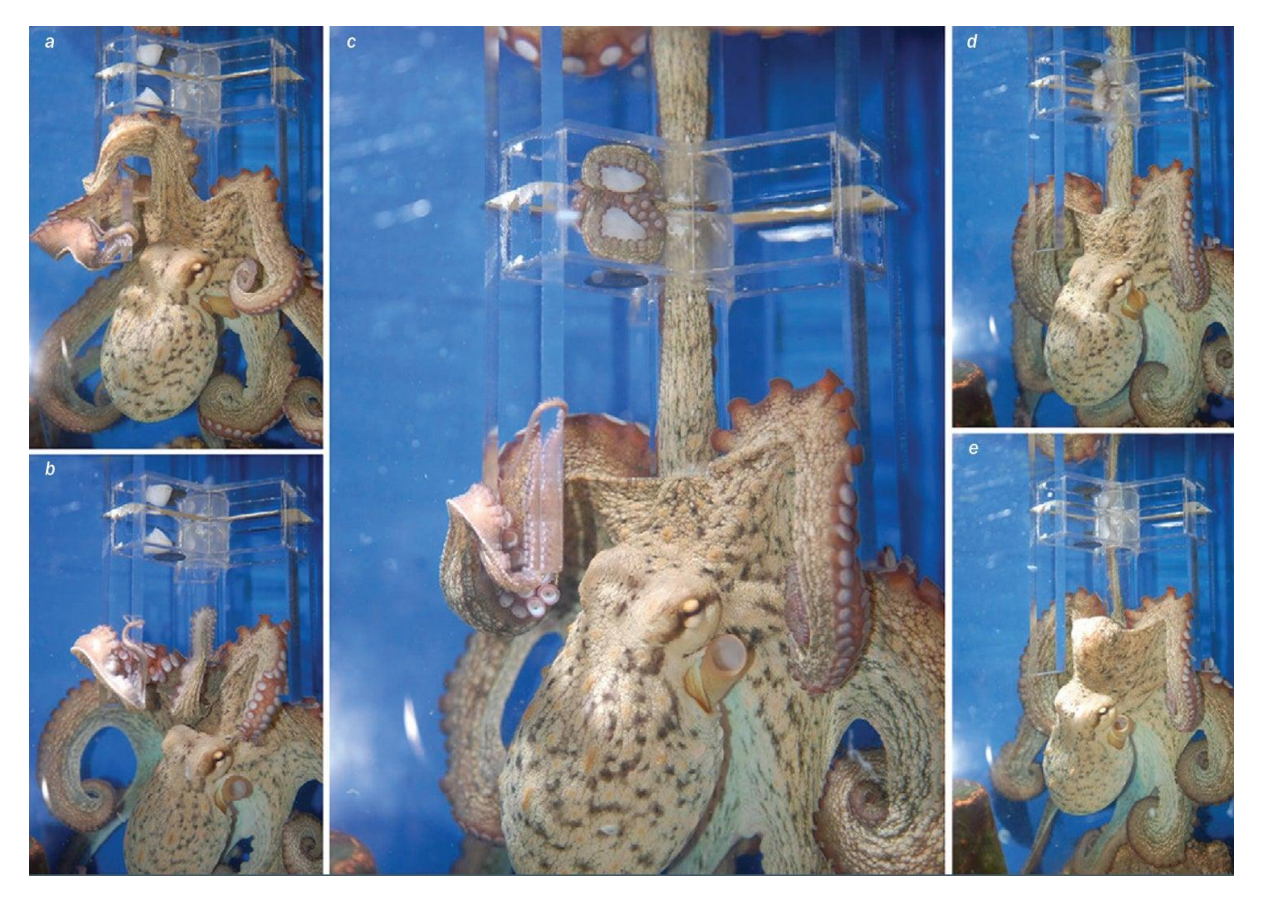
Figure 1: An octopus' arm can taste, touch and move without oversight from the brain. To test if the brain also has centralized, top-down control over the limbs, scientists designed a transparent maze. To reach a treat in the upper left compartment (a and b), the animals had to send an arm out of the water (c), losing guidance from their chemical sensors. They then had to rely on their eyes to direct the arm (d). Most succeeded (e).

In some analogy to what was observed with corvids (Jelbert et al., 2019; 2014), it has been furthermore argued for octopi too that they possess higher-order capabilities such as being aware of captivity (unlike fish, for example, that seem to not have the faintest idea that they are in a tank; Stefan Linquist in Godfrey-Smith, 2018, p. 56). What the latter sees as the distinctive feature of octopus intelligence is their so-called coconut-house behavior, a form of tool use, which illustrates the way they have become smart animals, displaying flexible behavior, creativity and adaptation to their environment (again linking back to Sternberg's, 2019, notion of adaptive intelligence ): Soft-sediment dwelling octopuses carrying around coconut shell halves have been repeatedly observed, assembling them as a shelter only when needed. Whilst being carried, the shells offer no protection and place a requirement on the carrier to use a novel and cumbersome form of locomotion — 'stilt-walking' (cf. Finn et al., 2009; Godfrey-Smith, 2013).