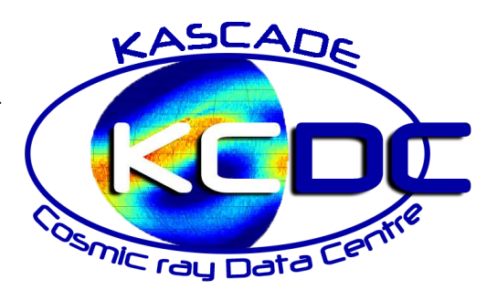
Figure 1: Logo of KCDC. The link to KCDC is https://kcdc.iap.kit.edu.

With KCDC [1] (figure 1), we provide the public the edited data, i.e. the reconstructed parameters of the primary cosmic rays measured by the detection of extensive air showers (EAS) with the KASCADE-Grande experiment – via a customized web page. The aim of this particular project was the installation and establishment of a public data centre for high-energy astroparticle physics. In the research field of astroparticle physics, such a data release was a novelty, whereas the data publication in astronomy has been established for a long time. KCDC provided the first conceptional design how the data of air-shower measurements can be treated and processed so that they are reasonably usable also outside the community of experts in the research field by the interested