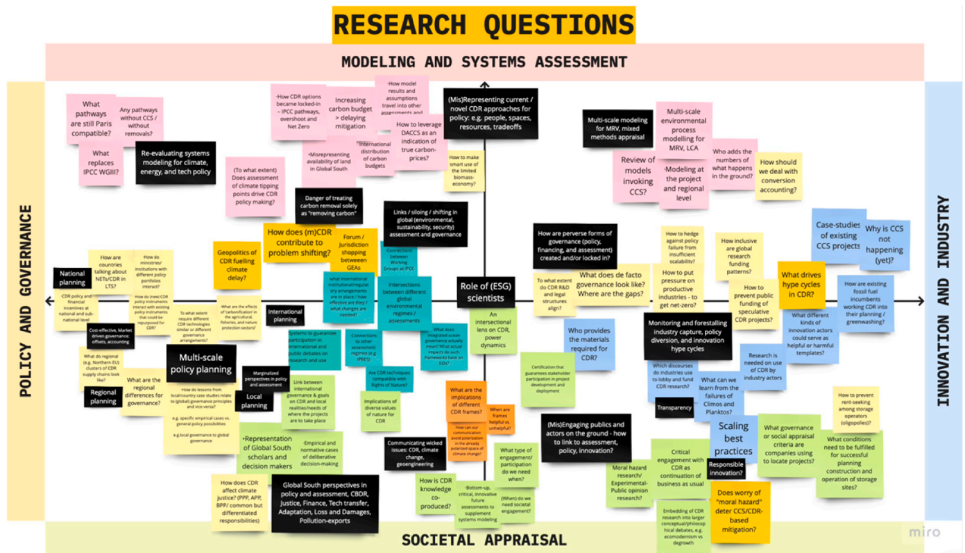
Fig. 3. Research questions.

The mapping framework is adapted from Boettcher et al. (2021) and Sovacool et al. (2023). It spans four intersecting areas: Modeling and systems assessment , Societal appraisal , Policy , and Innovation and Industry . The intersections between each major area (the six grey arrows) posit how activities in each area might reinforce or contest activities in the other three. The actors, activities and issues in boxes are intended as non-exhaustive, illustrative examples as a basis for mapping the wider range of actors, activities and issues relevant in each of quadrants.