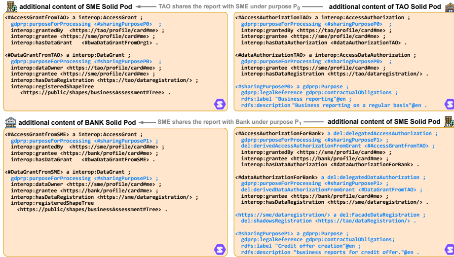
Fig. 3: Solid compatible chain of sharing business assessment reports.

(i.e., Solid Pods) with linked data that can be connected on demand to help companies thrive through collaboration based on their semantic data.