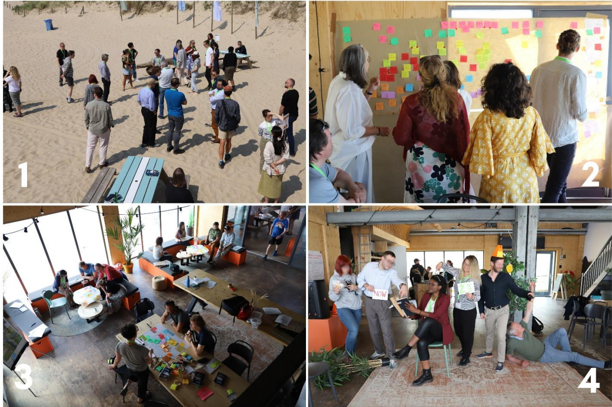
Figure 2 Pictures of the methods during the co-creation workshop. 1. Positioning in the NFF. 2. Backcast on a timeline. 3. Conditions and consequences on future wheels. 4. Image theatre.