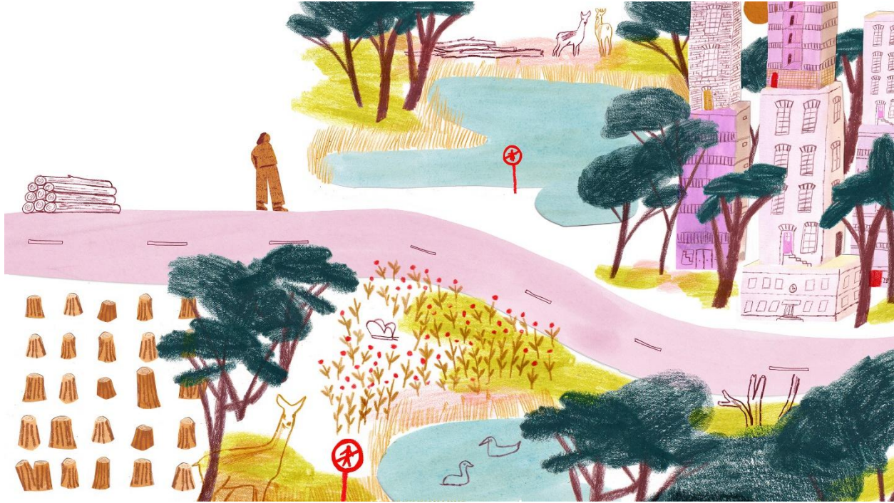
Figure 4 NaturAll pathway interpreted and illustrated by Maria Fraaije - Fraaijeboel

Main patterns of change identified in the pathway: