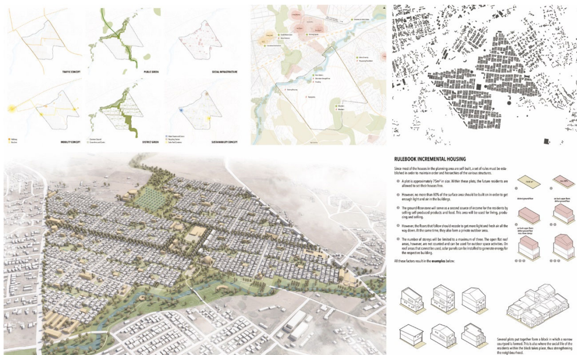
Figure 2: KIT Urban Design Master Studio, Sebeta, Ethiopia. By Lukas Benz, Xiang-Ru Zhu

These urban planning guidelines were used as a basis for an urban design master studio at Karlsruhe Institute of Technology (KIT). 16 To assist with the planning process, a design toolbox was provided, which sets guidelines for the distribution of space as well as assistance for the street layout and open space structure. This set of rules relates primarily to the organization and dimensioning of the basic structure. However, no rigid framework conditions are defined, but rather target corridors with certain spectrums of possible solutions are proposed, within which the designers can act freely. The aim is to use the design toolbox to speed up the planning process and quickly develop viable solutions.