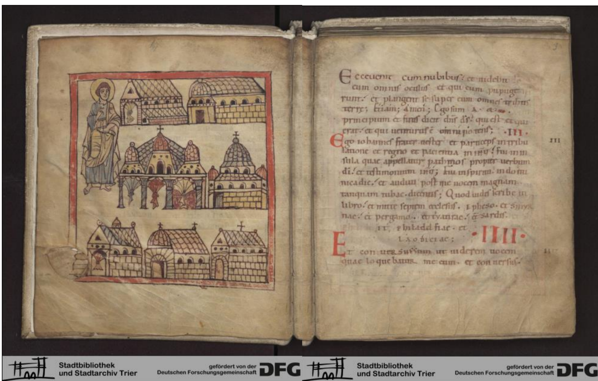
Public Library and Archive of Trier, Hs. 31 8°, 2v-3r